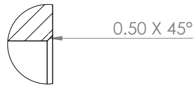
DETAIL B SCALE 3 : 1